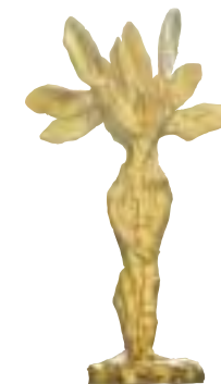
UNESCO PRIZE FOR PEACE EDUCATION (1993)